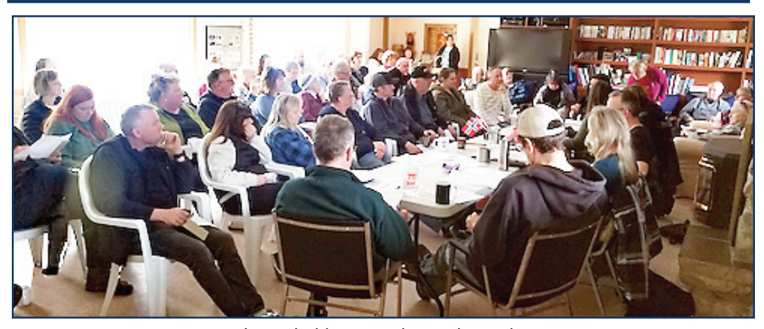
Leaseholders meeting at the park.

and his band, Valley Fyre played in the Gazebo at Hatzic last summer. In this case he will be playing not rock and roll but music more appropriate to the occasion. This is a great way to spend an afternoon.